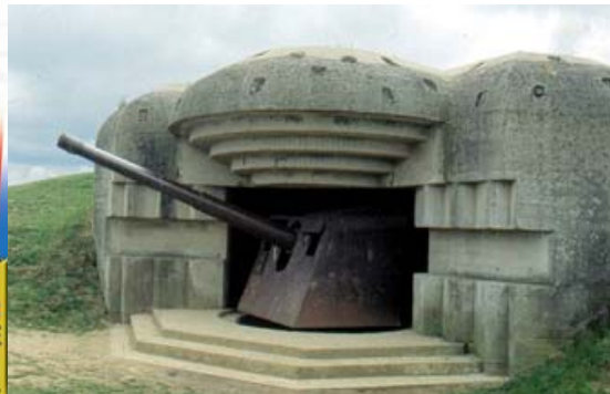
The "Atlantic Wall"