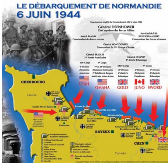
Map of German Coastal Defenses

We will visit the: D-Day cemetery, Utah and Omaha Beaches, St Mere Elglise, Cherbourg, Point Du Huc.