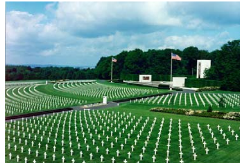
US Cemetery Luxembourg

Hotel: Best Western Hotel Melba 49-51 Avenue Mathieu, Bastogne, B-6600, Belgium Phone: 32 (0)61 217778