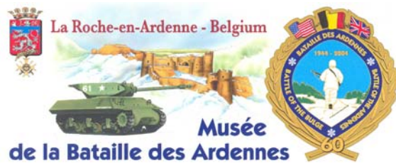
Battle of the Bulge Museum

Visits to Museum of the Ardennes, Bastogne and the American Cemetery in Luxembourg City / Hamm to see the final resting place of Gen. George S. Patton, Jr.